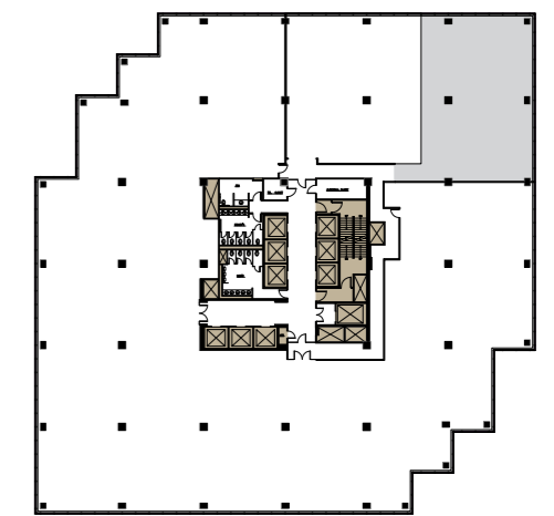
4TH FLOOR KEY PLAN